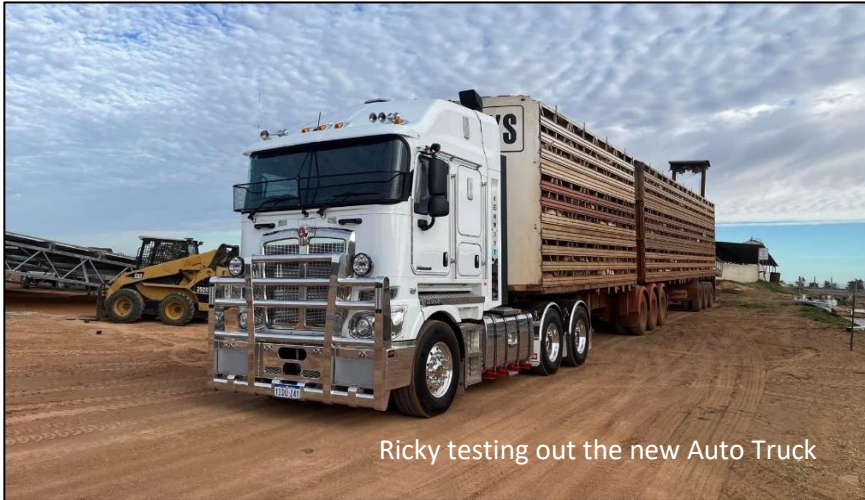
Ricky testing out the new Auto Truck