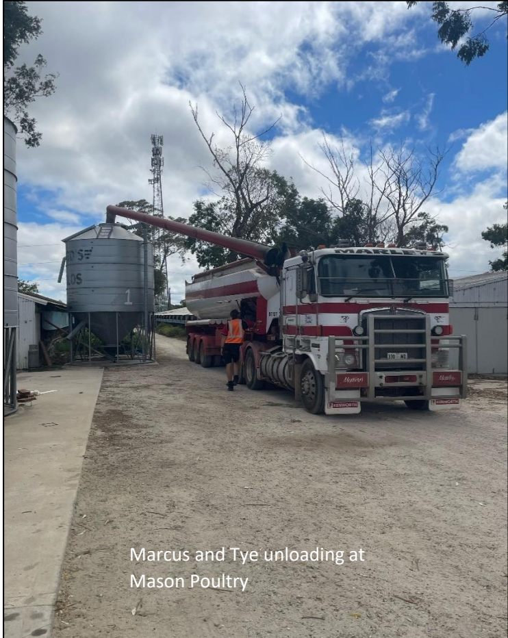
Marcus and Tye unloading at Mason Poultry

As we work together, let's remember the importance of treating each other with respect and dignity. This includes being mindful of the language we use, the jokes we make, and the way we interact with each other. Let's strive to create a workplace where everyone feels comfortable and valued. Respect is the cornerstone of a healthy work environment and it's essential that we treat each other with kindness and consideration. If you wouldn't say it to your mother, don't say it to another.