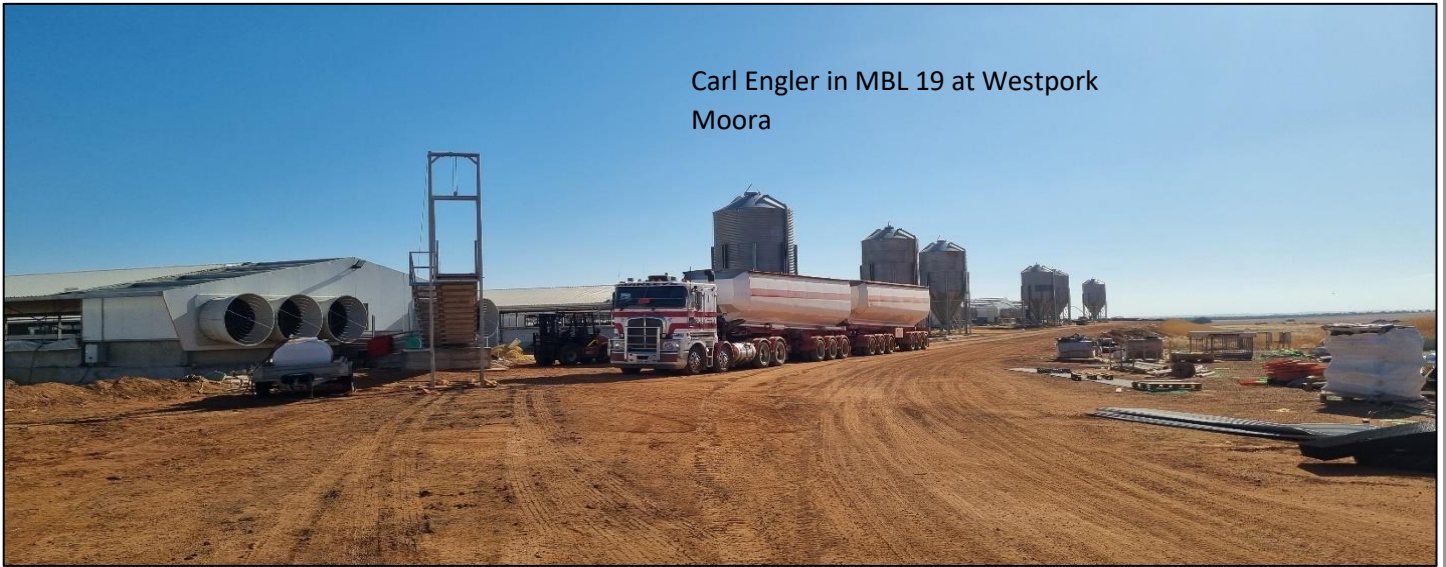
Carl Engler in MBL 19 at Westpork Moora