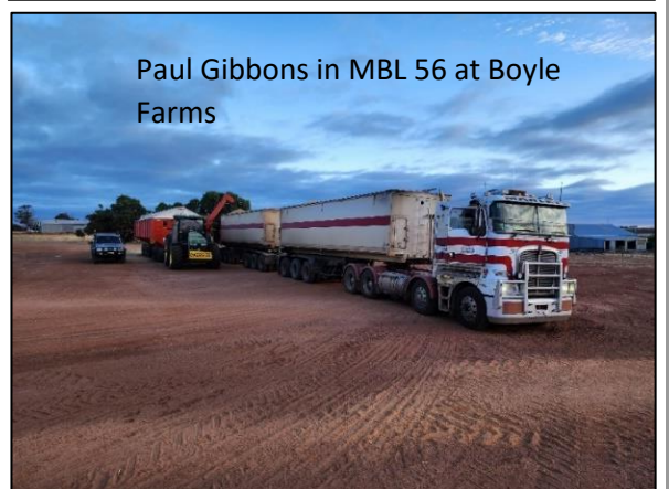
Paul Gibbons in MBL 56 at Boyle Farms

We pride ourselves on providing a reliable and efficient transport service to our customers