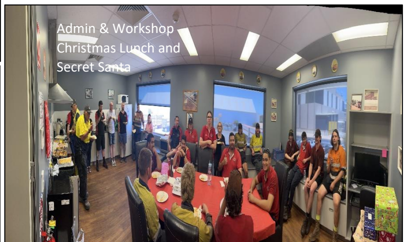
Admin & Workshop Christmas Lunch and Secret Santa

We pride ourselves on providing a reliable and efficient transport service to our customers