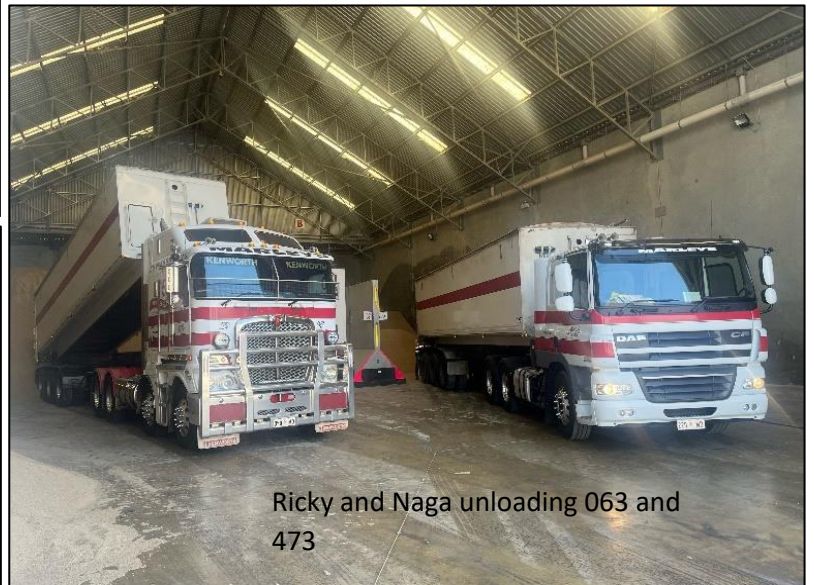
Ricky and Naga unloading 063 and 473