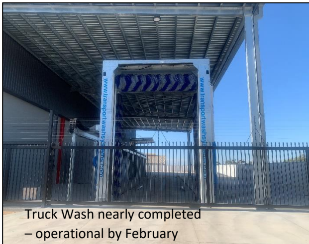
Truck Wash nearly completed – operational by February