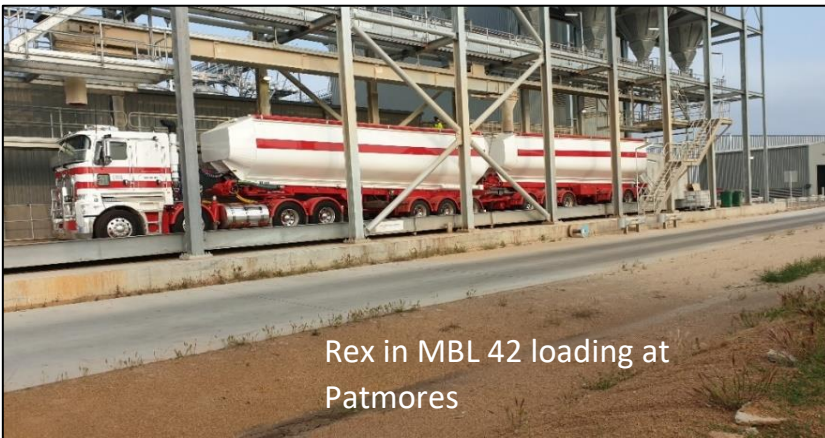
Rex in MBL 42 loading at Patmores