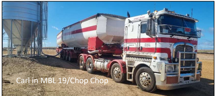
Carl in MBL 19/Chop Chop