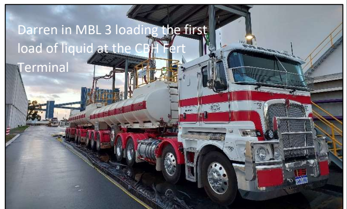
Darren in MBL 3 loading the first load of liquid at the CBH Fert Terminal