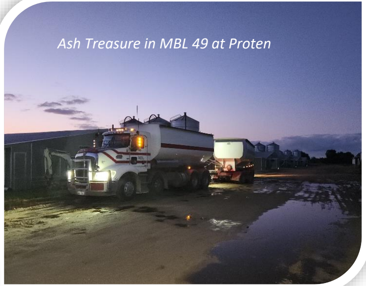
Ash Treasure in MBL 49 at Proten