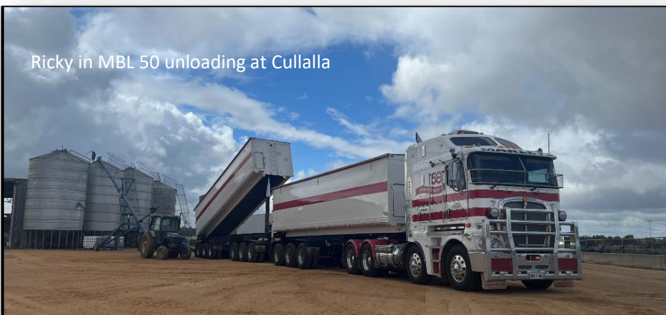
Ricky in MBL 50 unloading at Cullalla