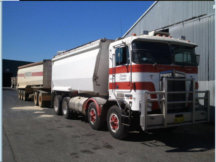
PHOTO COMPETITION SUBMISSIONS Thanks to everyone who sent in a photo, please keep them coming. Please remember when emailing them please send as large format.