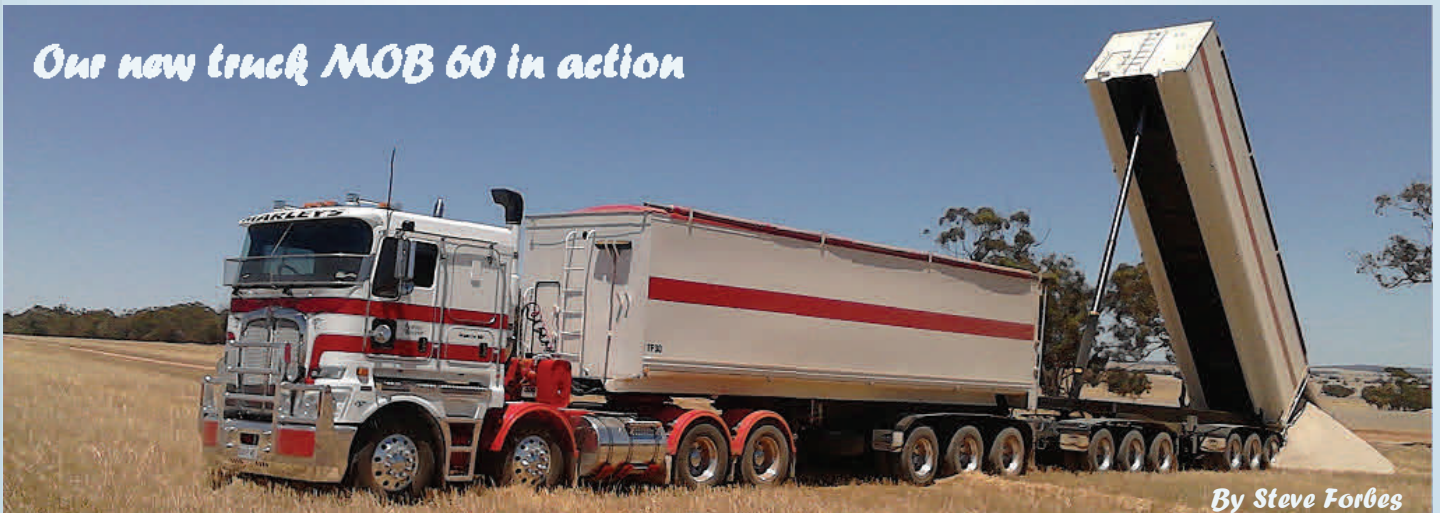
By Steve Forbes

We pride ourselves on providing a reliable and efficient transport service to our customers.