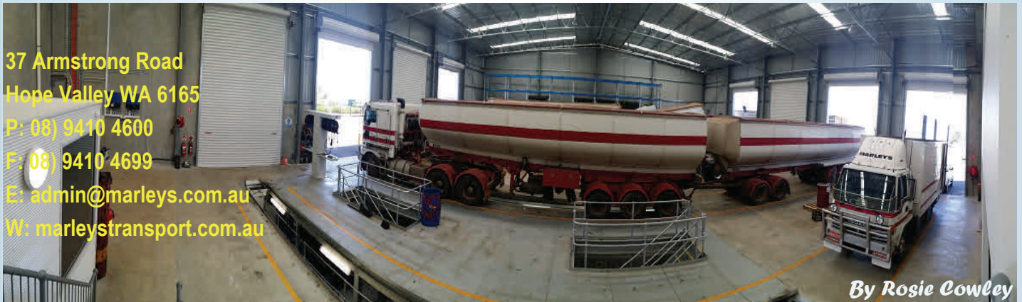
By Rosie Cowley

37 Armstrong Road Hope Valley WA 6165 P: 08) 9410 4600 F: 08) 9410 4699 E: admin@marleys.com.au W: marleystransport.com.au