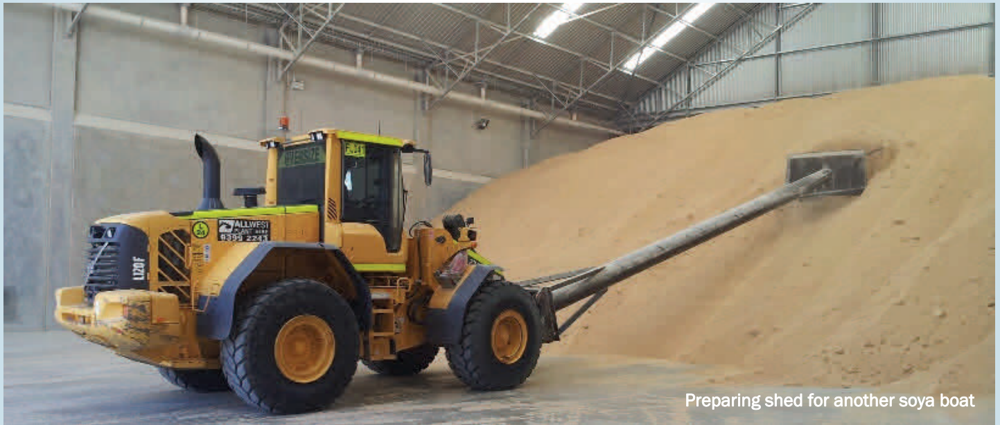
Preparing shed for another soya boat