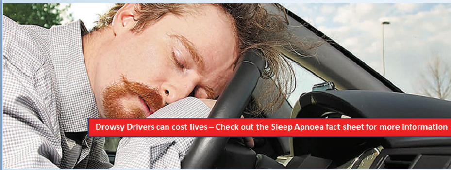
Drowsy Drivers can cost lives – Check out the Sleep Apnoea fact sheet for more information