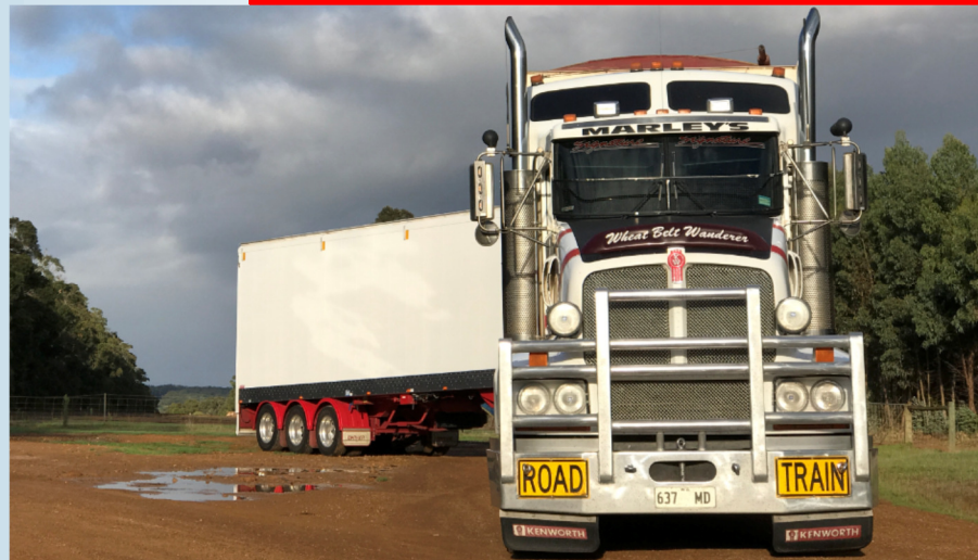
Above: Dan doing another load of woodchips out of Albany