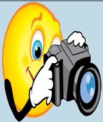
PHOTO COMPETITION SUBMISSIONS

Thanks to everyone who sent in a photo, please keep them coming. Please remember when emailing them please send as large format.