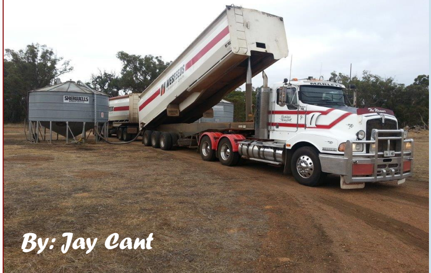
By: Jay Cant

Bill & Jason have had formal loader training. No one else is permitted to operate the loaders without documented training from one of these two people.