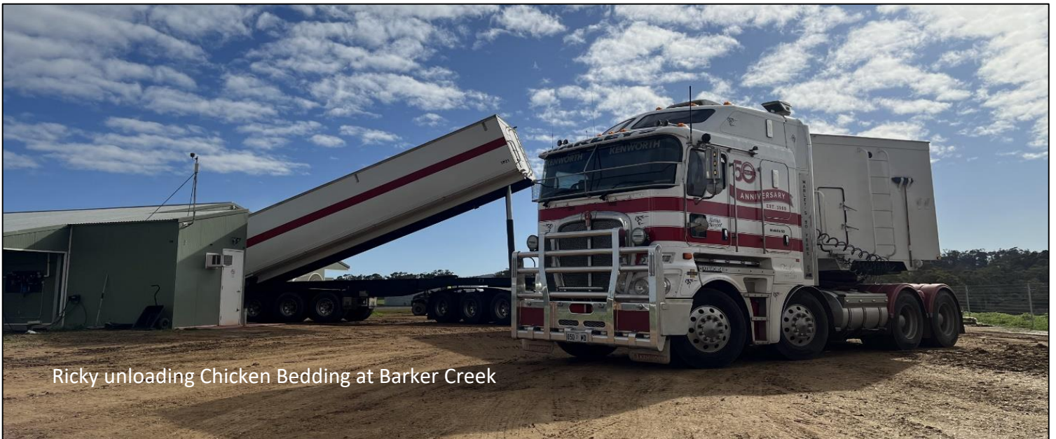
Ricky unloading Chicken Bedding at Barker Creek

And not just your truck! Aim for 3 small meals a day and 2-3 healthy snacks to keep your metabolism active.