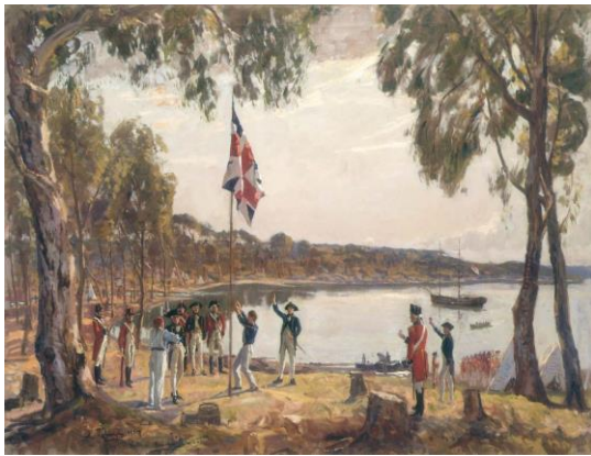
26 January 1788 – Captain Arthur Phillip raising the British Flag at Sydney Cove.

Some Indigenous Australians do not see this as a celebration but as the invasion of their land by Europeans and protest the celebration of this day. Some call it Invasion Day or Survival Day.