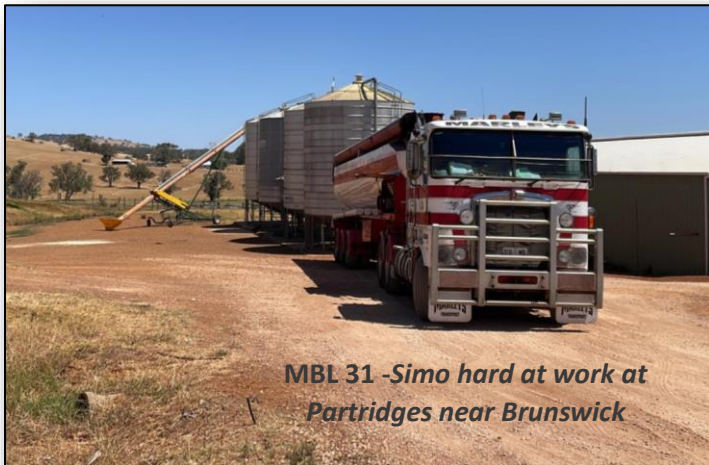
MBL 31 -Simo hard at work at Partridges near Brunswick