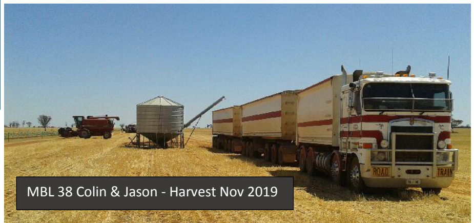
MBL 38 Colin & Jason - Harvest Nov 2019