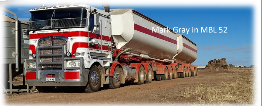
Mark Gray in MBL 52

We pride ourselves on providing a reliable and efficient transport service to our customers