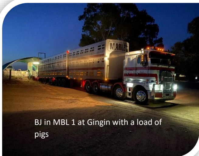
BJ in MBL 1 at Gingin with a load of pigs