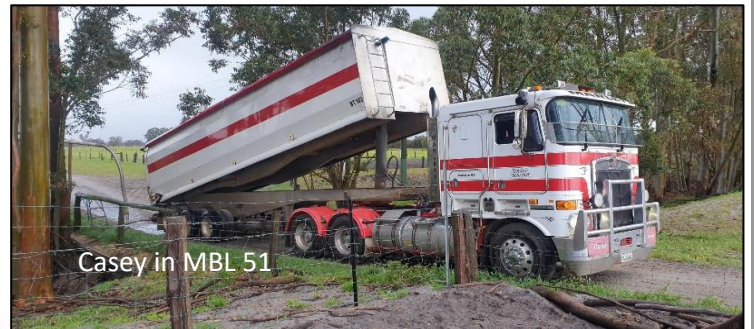
Casey in MBL 51