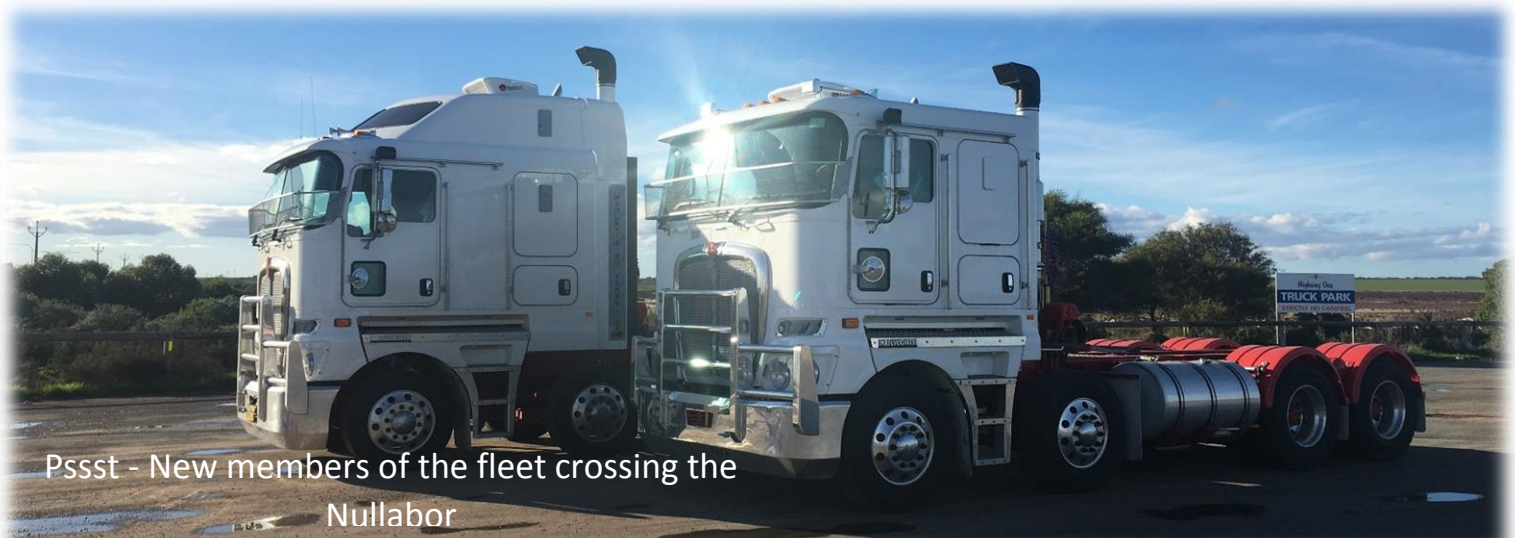
Pssst - New members of the fleet crossing the Nullabor

We pride ourselves on providing a reliable and efficient transport service to our customers