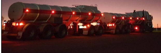
Darren in MBL 24 at Baandee Lakes Lookout at sunrise