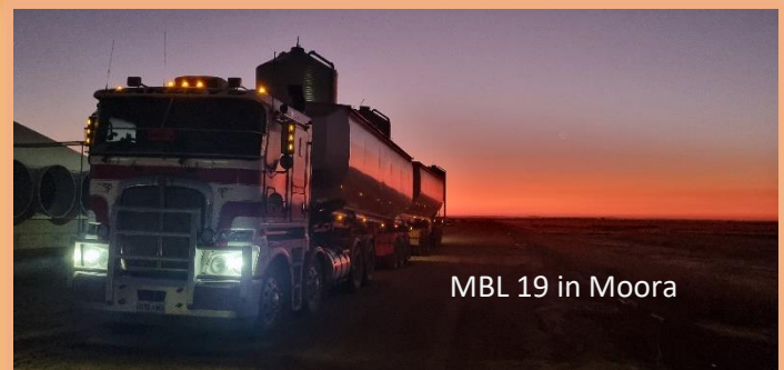
MBL 19 in Moora