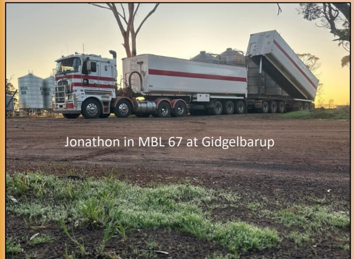
Jonathon in MBL 67 at Gidgelbarup