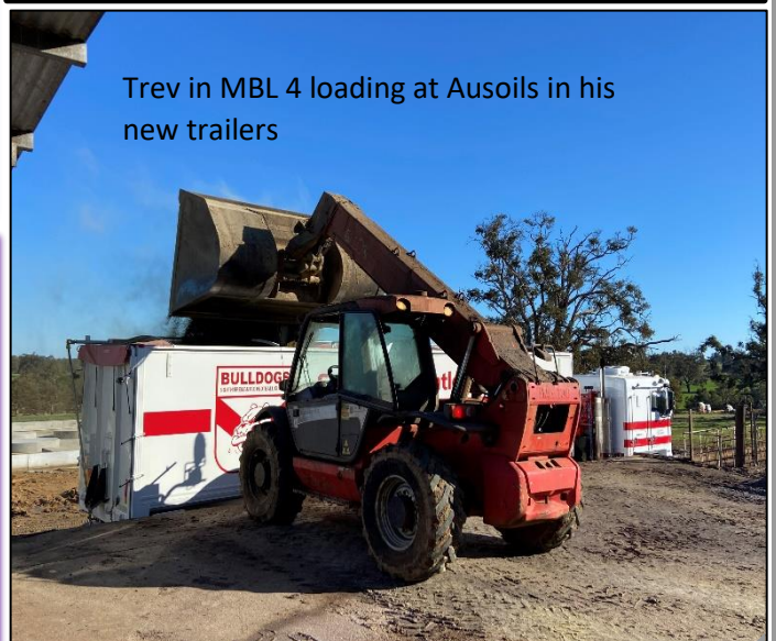
Trev in MBL 4 loading at Ausoils in his new trailers