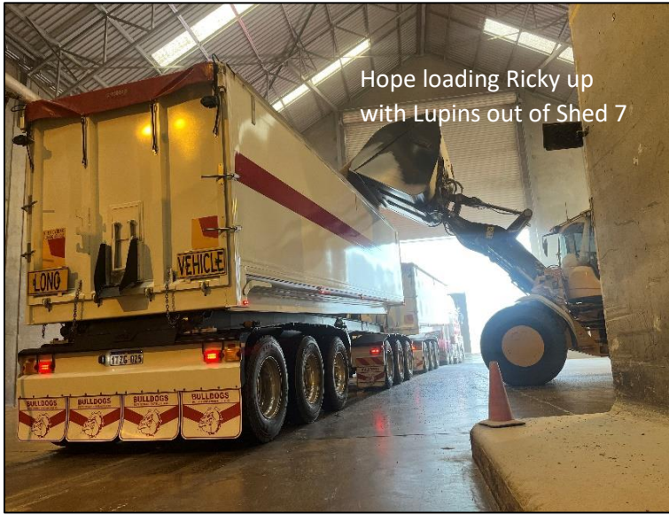
Hope loading Ricky up with Lupins out of Shed 7