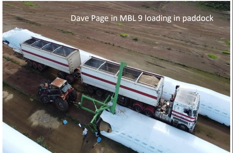
Dave Page in MBL 9 loading in paddock