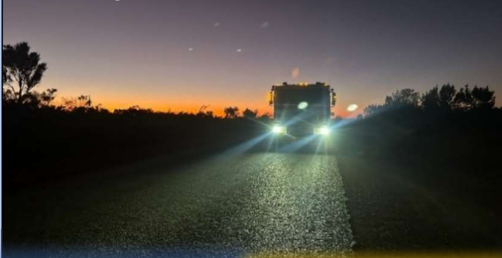
Jonathon in MBL 32 driving out of Mogumber