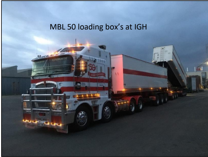
MBL 50 loading box's at IGH