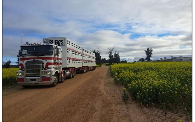
Brandon in MBL 15 using the new stock crates

We pride ourselves on providing a reliable and efficient transport service to our customers.