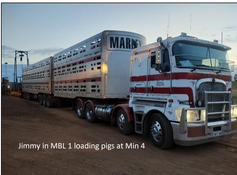
Jimmy in MBL 1 loading pigs at Min 4

Always keep a bottle of water on hand so it's easy to stay hydrated, boosting your energy and focus.